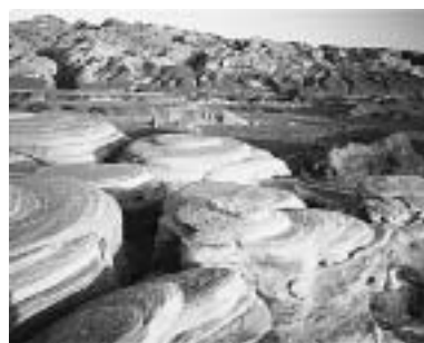
San Rafael Reef

"W ow," we all thought as the view stole away our breath and the ability to utter a sound. My two friends and I had just climbed straight uphill for a half hour, eager to strap on our