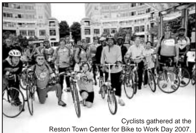
Cyclists gathered at the Reston Town Center for Bike to Work Day 2007.