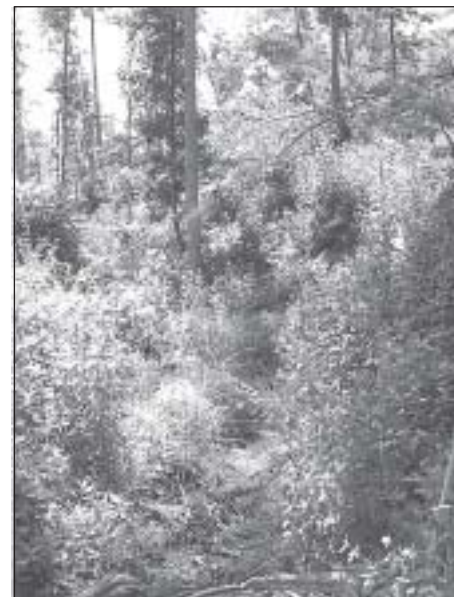
Forest Service logging over stream and riparian area in Little Allegheny Roadless Area.

In the afternoon, we will hike in the vicinity of the 7,800 acre Warm Springs Mountain, a scenic Virginia Mountain Treasure